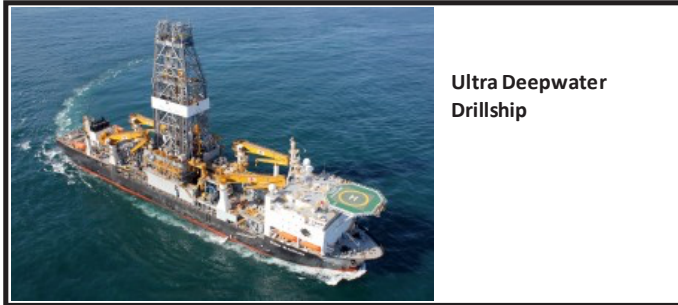
Ultra Deepwater Drillship